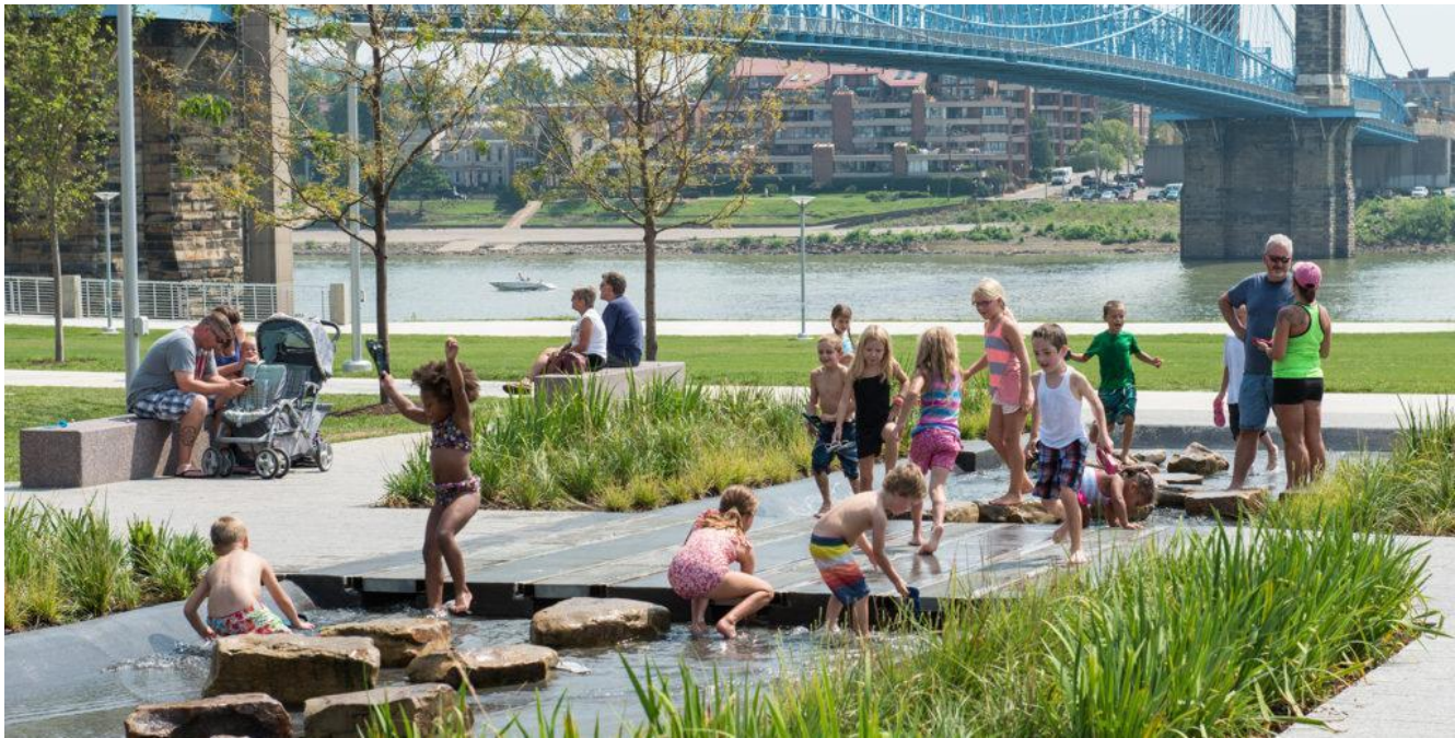
Interactive play areas encourage children and adults of all ages to be together, while also providing respite from the heat.