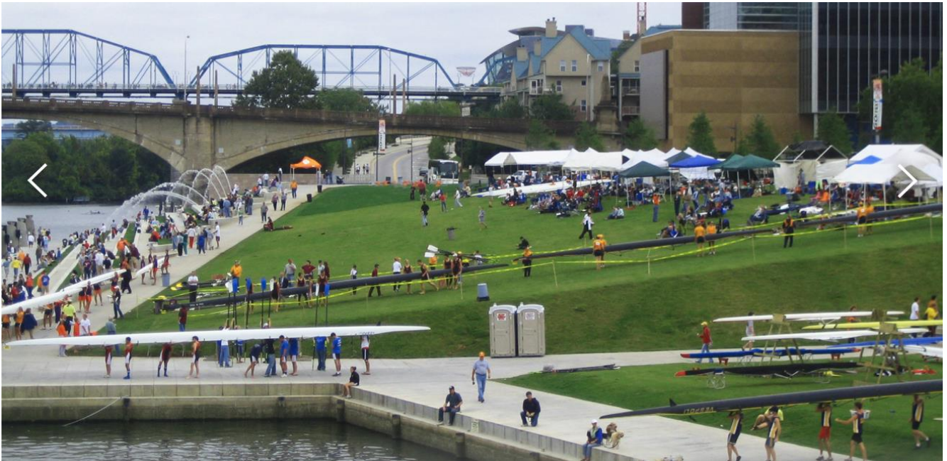
Ross's Landing