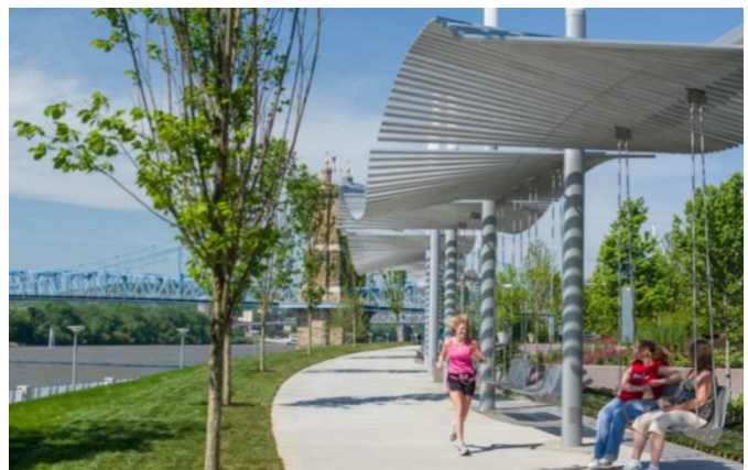
Artistic shade structures along the Riverwalk