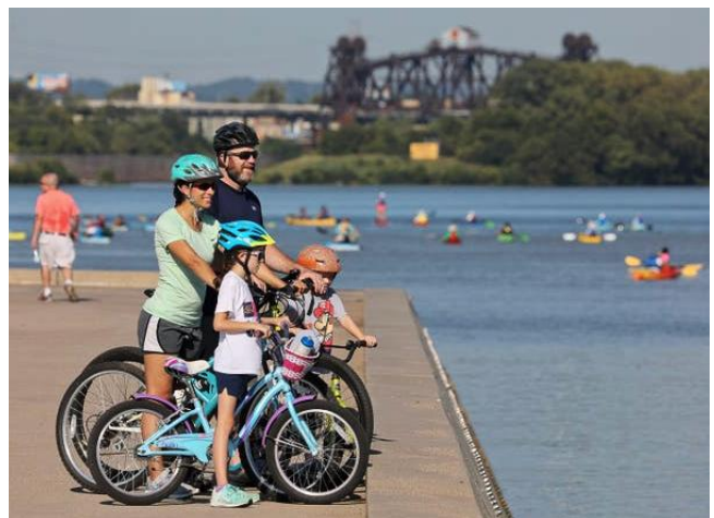
Subway Fresh Fit Hike, Bike & Paddle 2018