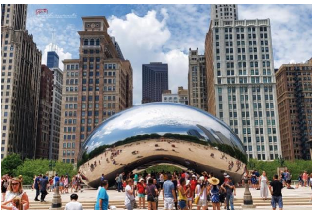
Cloud Gate Sculpture in Millennium Park