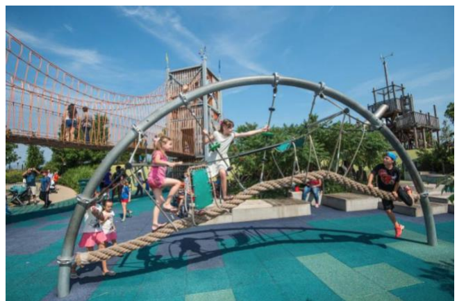
Maggie Daley Park