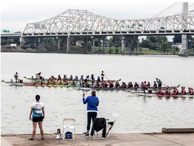
Louisville Dragon Boat Festival