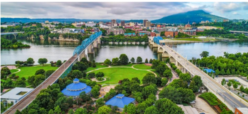
Coolidge Park with pedestrian bridge, looking towards Ross's Landing. Renaissance Park is to the right.