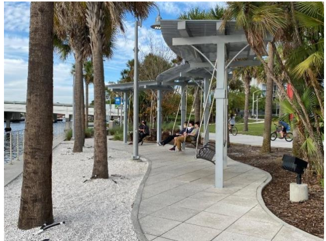
The Tampa Riverwalk

Tampa's downtown is graced by numerous waterfront parks and trails: Curtis Hixon Park, Julian B. Lane Riverfront Park, Water Works Park, and a 2.4 mile connected Riverwalk with plans to add 22 more miles.