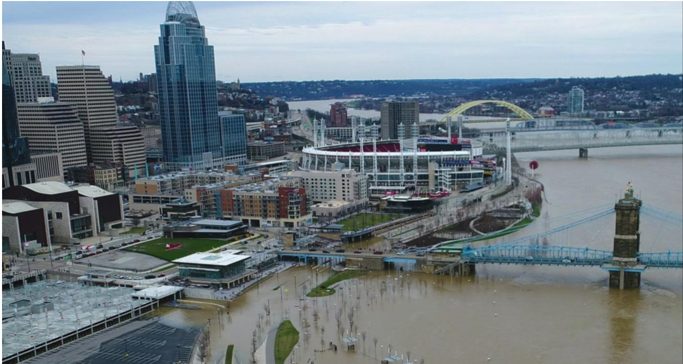
Park was designed for resiliency, to protect the downtown buildings and allow the park to be easily restored for use.